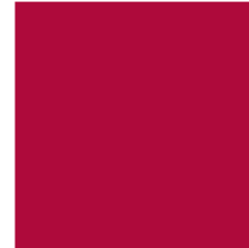
RED HOT CHILLI