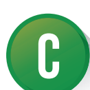
Celery (and Celeriac)