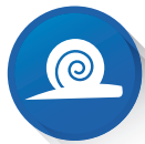
Molluscs (e.g. clams, mussels, whelks, oysters, snails, squid)